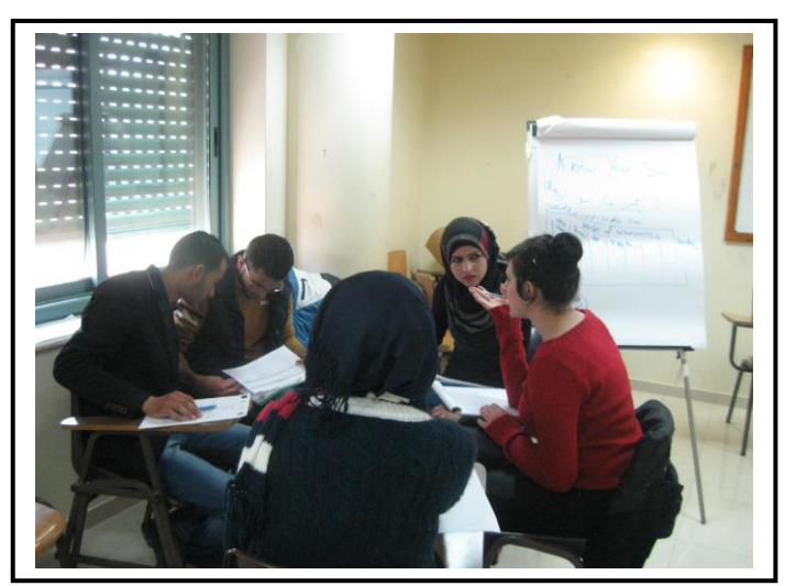
Sexual and Reproductive health